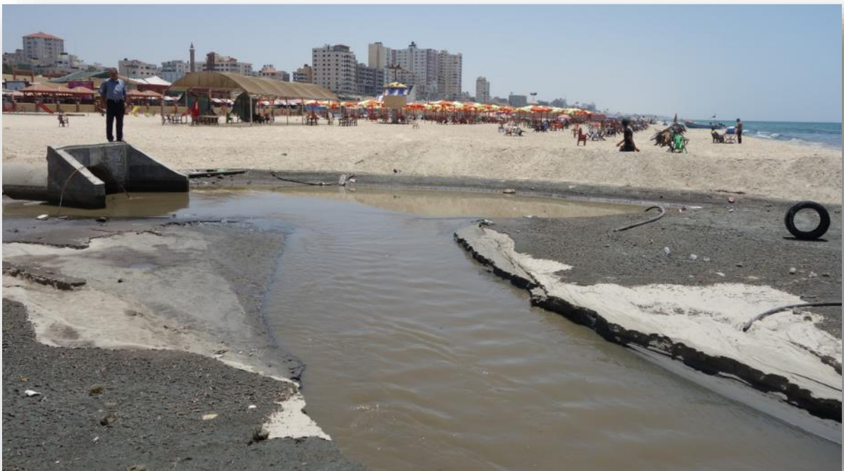
June 2014: Rivers of raw sewage now flows directly into the open sea from Gaza Municipality's Pump Stations number 1, 2, 3 and 9, totalling around 65.000 cubic meters of raw sewage daily, only from Gaza City.

During my guided tour to one of the largest raw sewage collection and pumping stations in Gaza City, I found a well-organized, properly staffed and modern sewage processing plant, which all pumps and functions nullified. They had been stopped due to lack of funds to buy fuel to operate the two large generators, generators needed to compensate for the lack of stable and sufficient electrical power supply to Gaza. The abhorrent smell from the raw sewage now running untreated into the nearby white shores of the Mediterranean sea had left the large seaside cafeteria and playing ground for Gaza's much tested children all but empty.