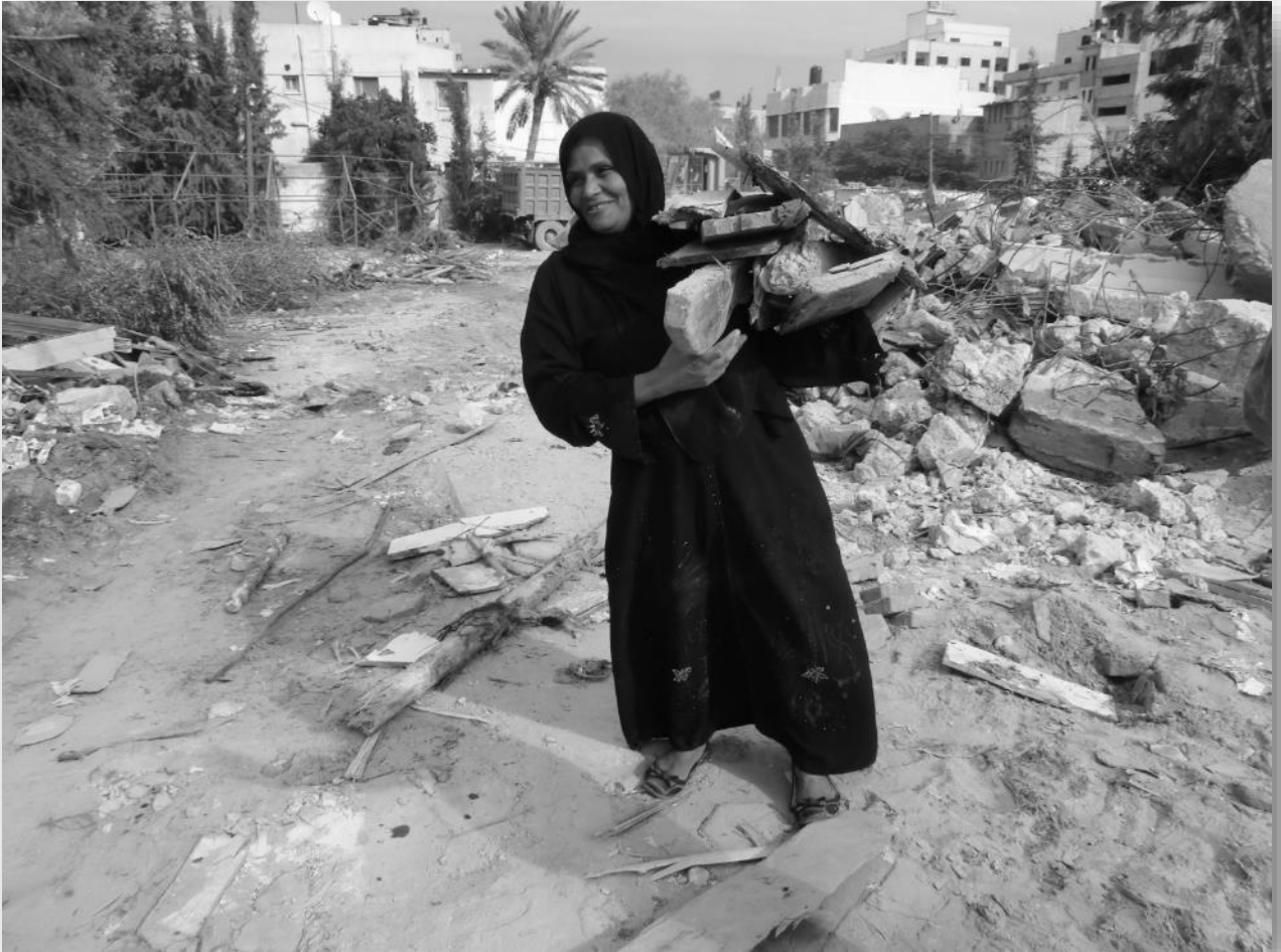
Destruction and resilience: A Palestinian woman is clearing up her destroyed home following Israeli bombing, Gaza City Nov 2012