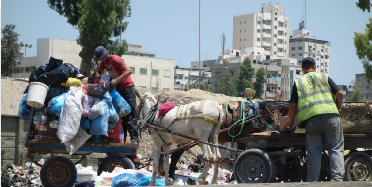
Solid waste donkey carts emptying the collected city garbage at the Yarmook transfer station for later to be transport further to landfill side. Gaza Municipality, June 2014.

running out in November. The garbage collection workers have so far been working two shifts, but is reduced to one shift due to money and fuel constraints, severely impeding capacity.