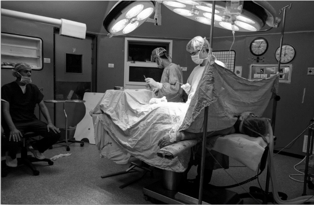
Shifa Hospital, OR, night shift, June 2014: despite desperate lack of staff salaries, medical equipment, drugs and disposables, good medical work is carried out.

level of medical services to the people of Gaza, which they all see as their primary duty. Shifa Hospital's staff and leadership have high aspirations and wish to perform state-of-the-art medicine, evidence based practise and research, but siege and serious deficiencies deny them this right.